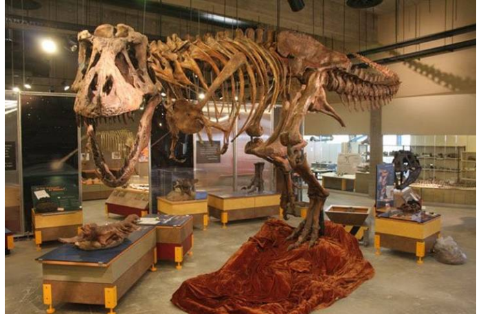
Scotty the T.Rex

Editor's Note: Scotty is now Saskatchewan's official provincial fossil