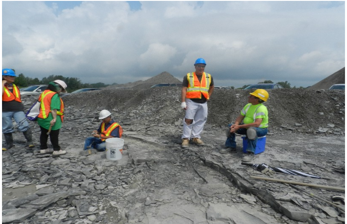
Euriptyrid Hunt, Ridgemount Quarry July 2017

c/o 120 South Drive St.Catharines, Ontario L2R 4V9