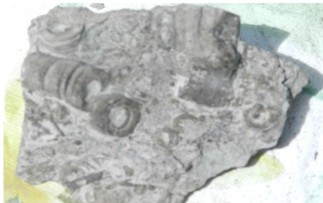
Ridgemount South Quarry fossils found July 2017