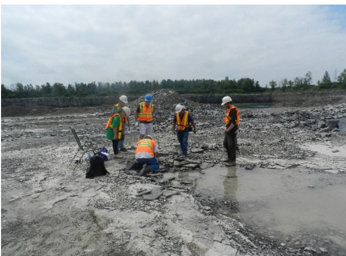
Eurypterid unearthed, Ridgemount July 6, 2017