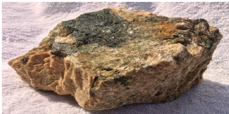
Radioactive rock, MacDonald Mine found on Bancroft Trip Day 2

You can look forward to Ashley's verbal Field Trip report at our meeting or check out the Daily Field Trip Diary on our Facebook page.