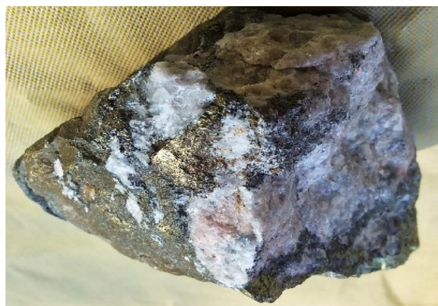
Quartz, pink calcite (?), pyrite, & chalcopyrite from Nipissing Mine Site – Killarney Day 5

Saturday, August 12th thru Sunday, August 20th, 2017